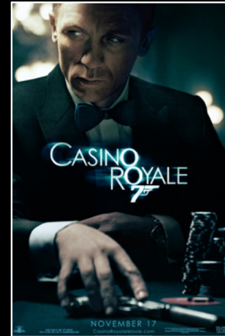
3. Casino Royale