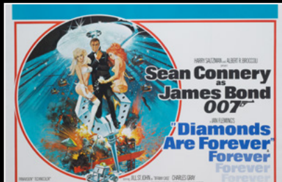
4. Diamonds Are Forever