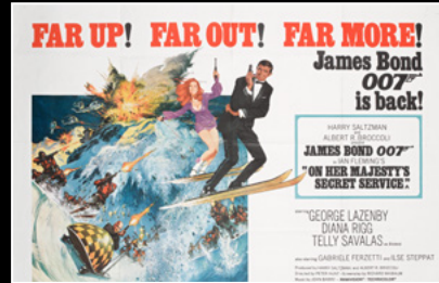
2. On Her Majesty's Secret Service