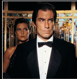
3. Licence to Kill