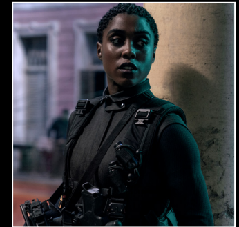
5. No Time To Die